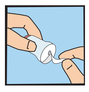
Pull gently to remove the paper from the adhesive tape.